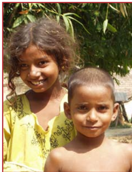
Your stickers will put Christmas SMILES on children's faces