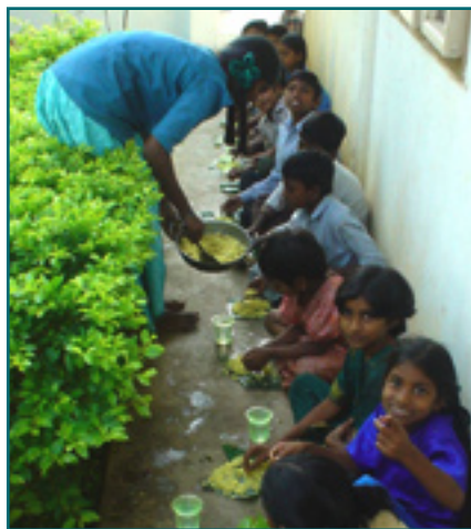
You can put smiles on their faces!