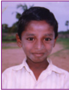
Koka: ready and waiting